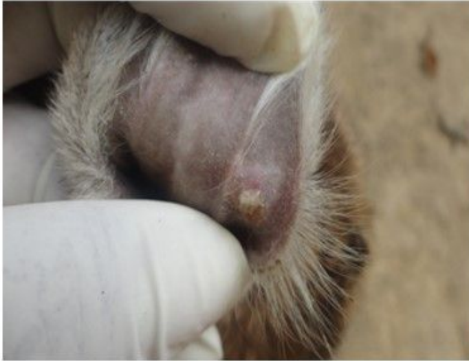
Fig. 3 Photograph showing a papule that has ulcerated on the ear pinna.

Photograph exhibiting papules found on mouth, nares and ear.