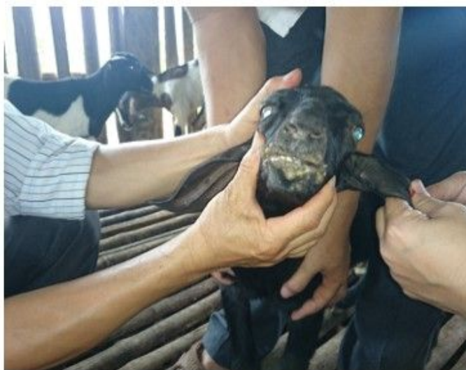
Fig. 2 Photograph exhibiting papules found on mouth, nares and ear.

Photograph showing ulcers in nasal cavity and rhinitis.