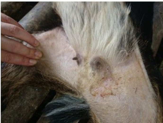
Fig. 4 Photograph of infected goat's udder denoting ulcers and inflammation.

Photograph showing a papule that has ulcerated on the ear pinna.