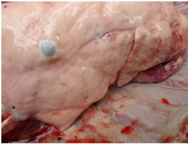
Fig. 5 Photograph of a well-circumscribed greyish pock lesion in the lung of an infected goat

Photograph of infected goat's udder denoting ulcers and inflammation.