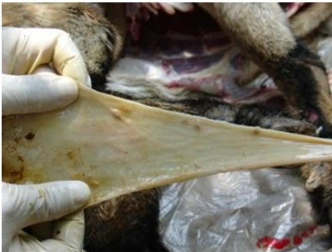
Fig. 6 Photograph of calcified papules on the intestinal mucosa of an affected goat.

Photograph of a well-circumscribed greyish pock lesion in the lung of an infected goat