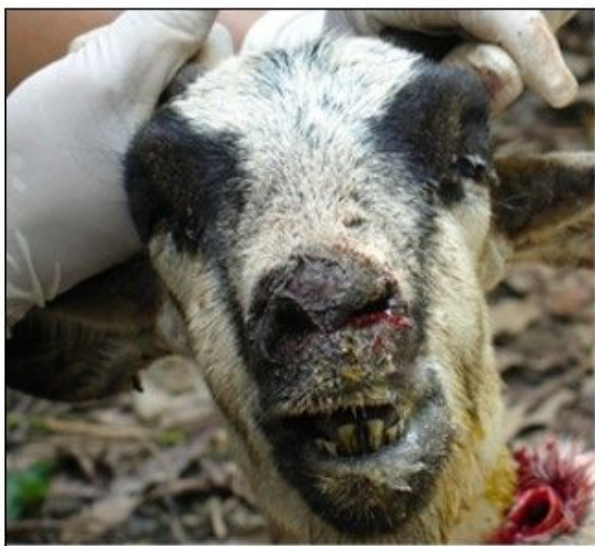
Fig.1 Photograph showing ulcers in nasal cavity and rhinitis.