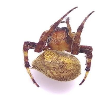
Neoscona bengalensis 2