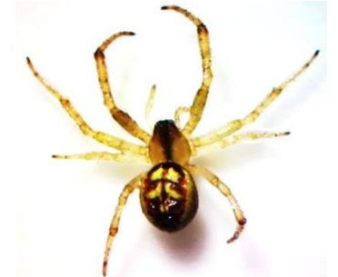
Guizygiella spp. 2