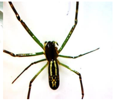
Nephila spp. 1