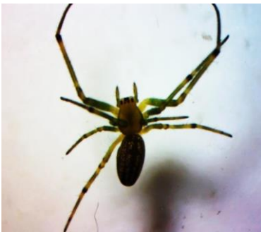
Leucauge decorate 2