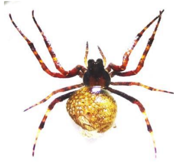
Neoscona bengalensis 3