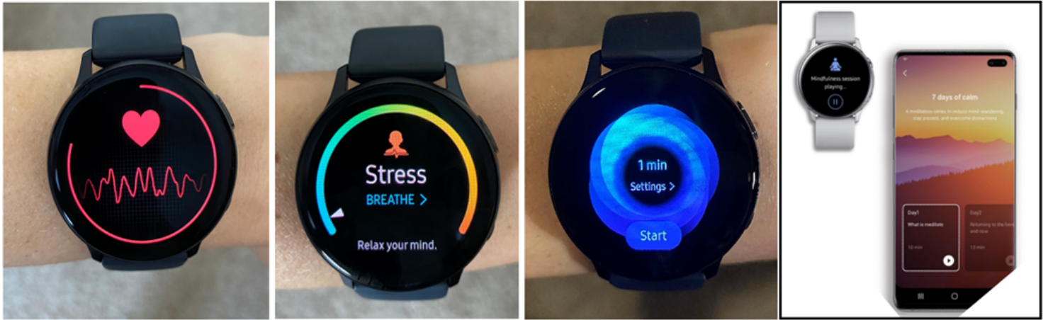
Panel A: heart rate