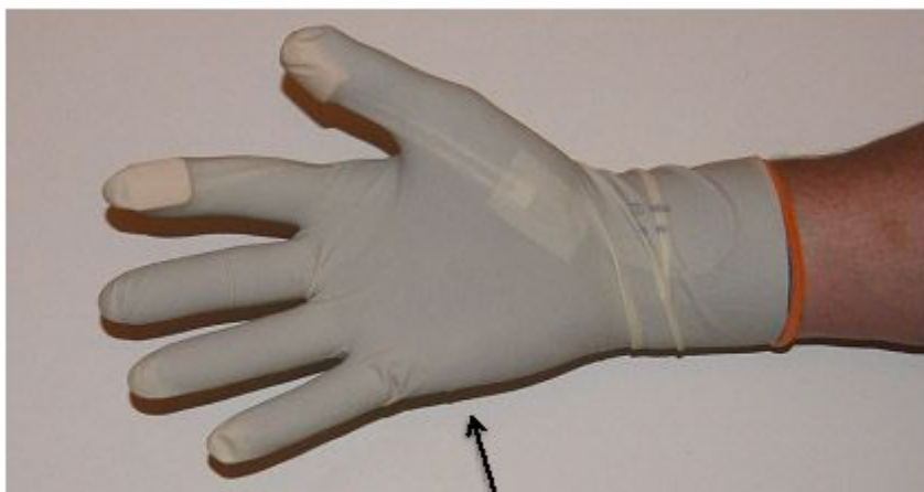
MG covered with a sterile surgical glove