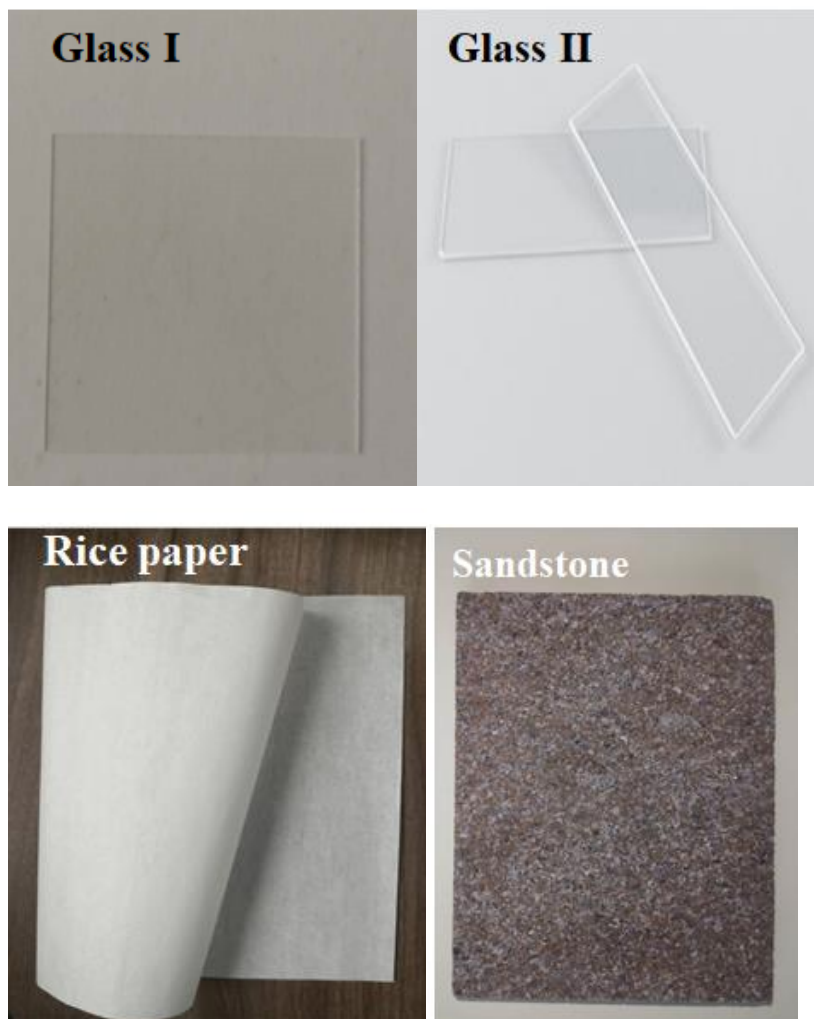
Figure 1. Photos of glass I, glass II, rice paper and sandstone used in the work

* Corresponding authors. E-mails: xhuang@shu.edu.cn; ycsong@shu.edu.cn