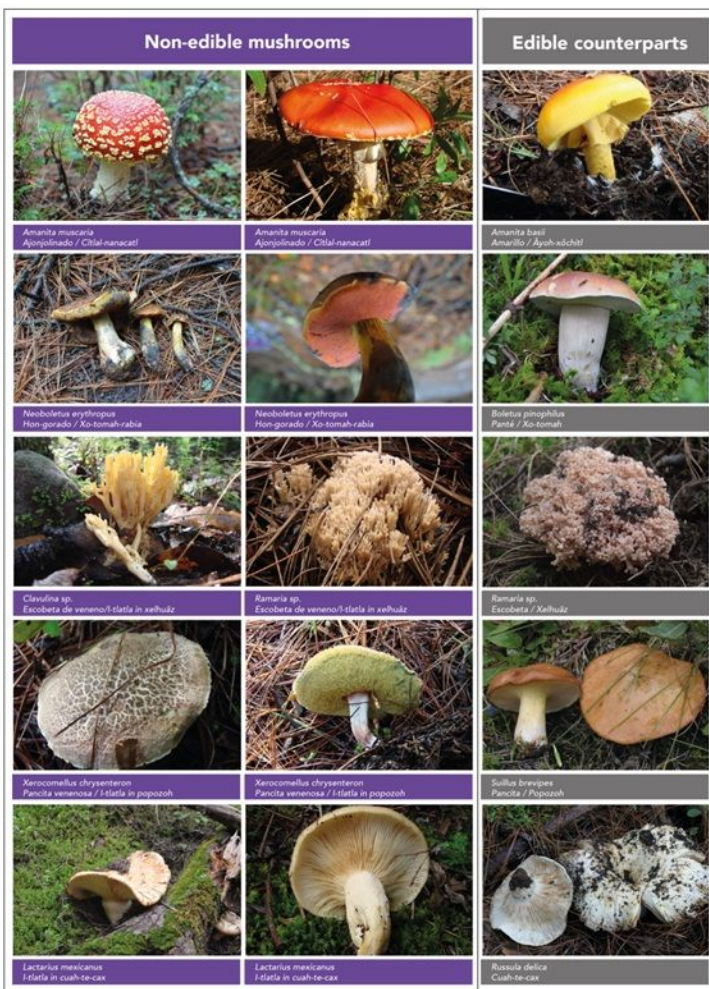
Figure 3 Examples of edible and non-edible mushrooms duality.