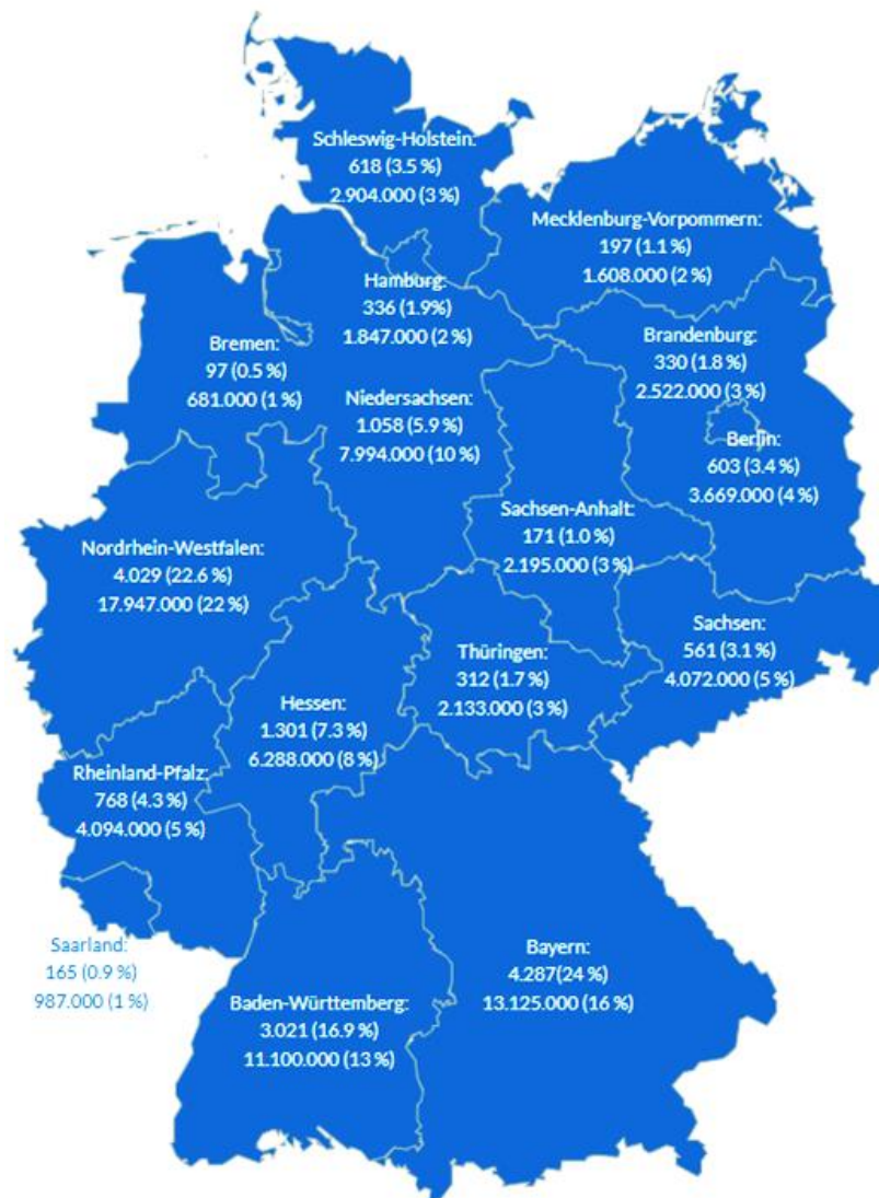
Figure 2: Distribution of participants by federal state. First row: Name of the federal state, second line: Parents in the registry, as absolute and relative frequency (as of 26.10.2020). Third line: Population in Germany in comparison, as absolute and relative frequency. The distribution of contributors corresponds approximately to the respective share of the population.

certificate, and 31 participants (0.2%) stated that they had no school or training qualification. The remaining did not enter an education. The participation of contributors per state corresponds to the distribution of the population (Figure 2).